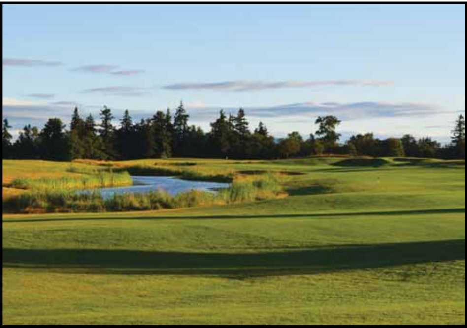
A great winter course, North Bellingham is known for its great conditioned greens and fairways.