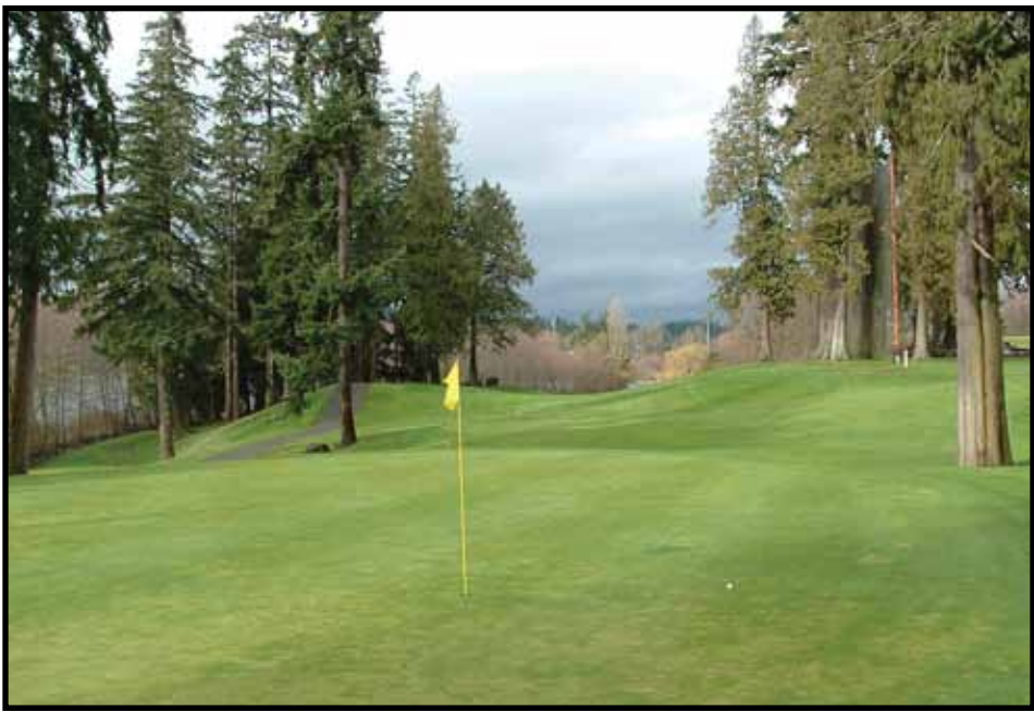
Tall trees and numerous hazards make the Nile Shrine Golf Course a challenging round of golf.