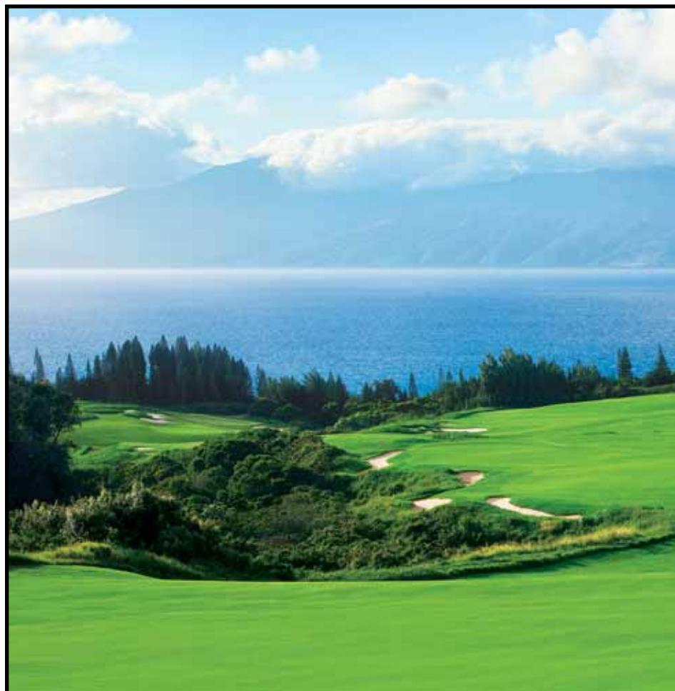
There is plenty of terrific golf to find on the island of Maui including Wailea Resort with its three courses including the Gold (bottom); Kapalua's Plantation course (pictured above) is the home for the PGA Tour's Tournament of Champions; Ka'anapali Resort (very top) features two courses.