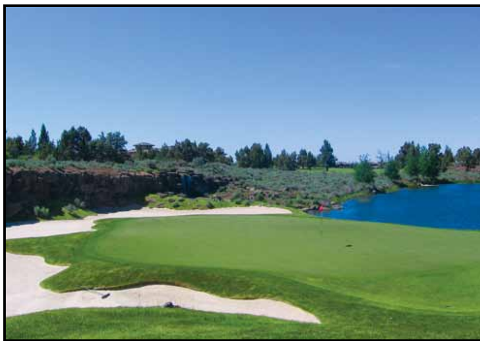
Troon Golf operates courses throughout the world, including Poston Butte (top) and Pronghorn.